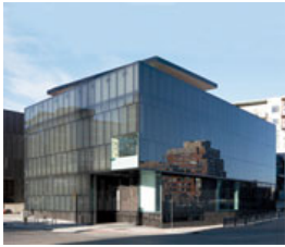
Museum of Contemporary Art Denver