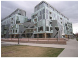
Studio Daniel Libeskind with Davis Partnership Architects