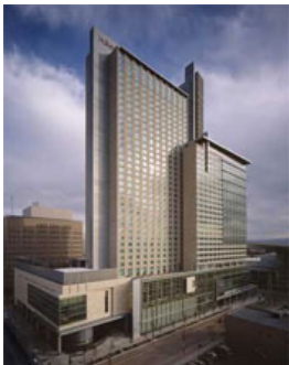
Hyatt Regency Denver at Colorado Convention Center

Klipp with Brennan Beer Gorman Architects