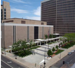
Byron G. Rogers U.S. Courthouse