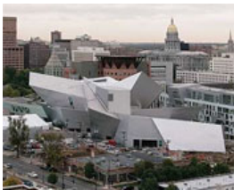
Frederic C. Hamilton Building at the Denver Art Museum

Studio Daniel Libeskind with Davis Partnership