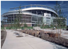
Sports Authority Field at Mile High (Formerly Invesco Field)