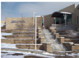
October 2012—Architecture Heals

What do you do with a building that's been the site of a mass shooting? Tear it down? Remodel it? Turn it into a memorial for the victims? How do you make a decision?